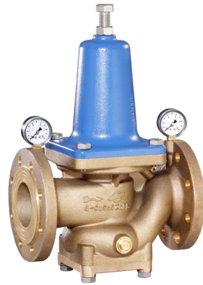
DRV 602-6 (DN 65 - DN 150)