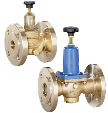
SP 90 Flange connection acc. to DIN EN 1092