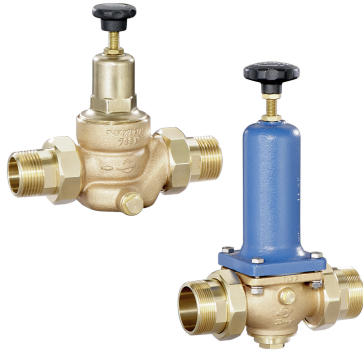
SP 90 Threaded connection acc. to ISO 7