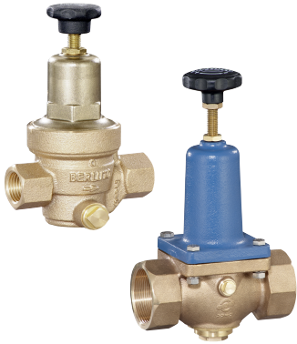
SP 90 Threaded connection acc. to ISO 228