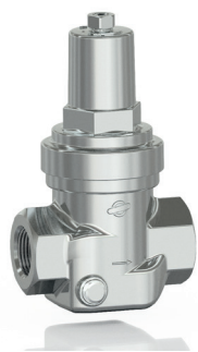
DRV 730-D Type A (DN 15 - DN 32)