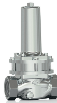
DRV 730-D Type B (DN 40 - DN 50)